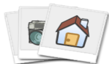
Photo not available

Property Type: Vacant Land Area: 8,482 m 2 Area $/m2: $0 RPD: AL506//D124288