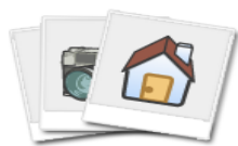
Photo not available

Property Type: Vacant Land Area: 2.19 ha Area $/m2: $0 RPD: AL510//D124288