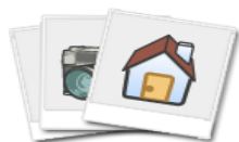
Photo not available

Property Type: Vacant Land Area: 347 m 2 Area $/m2: $735 RPD: AL50//D123884