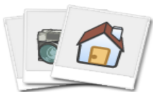
Photo not available

Property Type: Vacant Land Area: 379 m 2 Area $/m 2 : $528 RPD: AL11//D122846