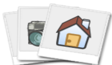
Photo not available

Property Type: Unit Area: 66 m 2 (140 m 2 ) Area $/m 2 : $7,576($3,571) RPD: FL9//C27564