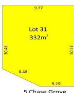
5 Chase Grove

Property Type: Other Area: Area $/m 2 : RPD: