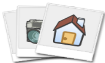
Photo not available

Property Type: Vacant Land Area: 332 m 2 Area $/m 2 : $1,160 RPD: AL31//D124058